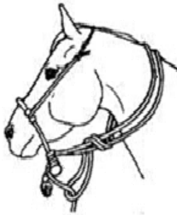
Example of correctly hitched mecate.